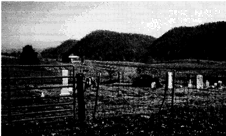
Figure 4 Alderson Cemetery, near Abingdon, Washington Co., VA.